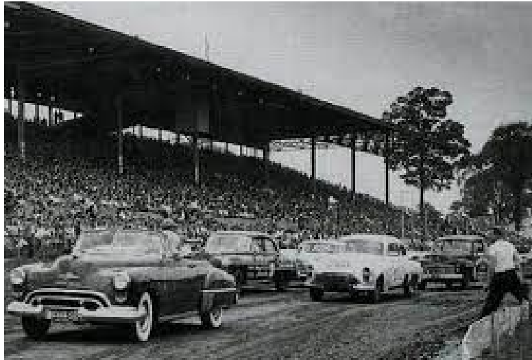
Canfield, Ohio Fairgrounds Speedway